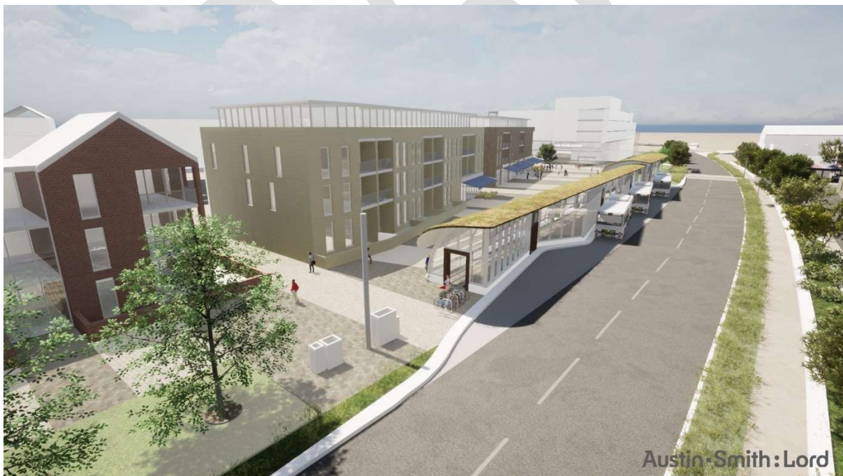
Porthcawl Regeneration Artist Impression

The effective management and control of risk are also prime objectives of the Council's treasury management activities. The Treasury Management Strategy therefore sets out various indicators and limits to constrain the risk of unexpected losses and details the extent to which financial derivatives may be used to manage treasury risks.