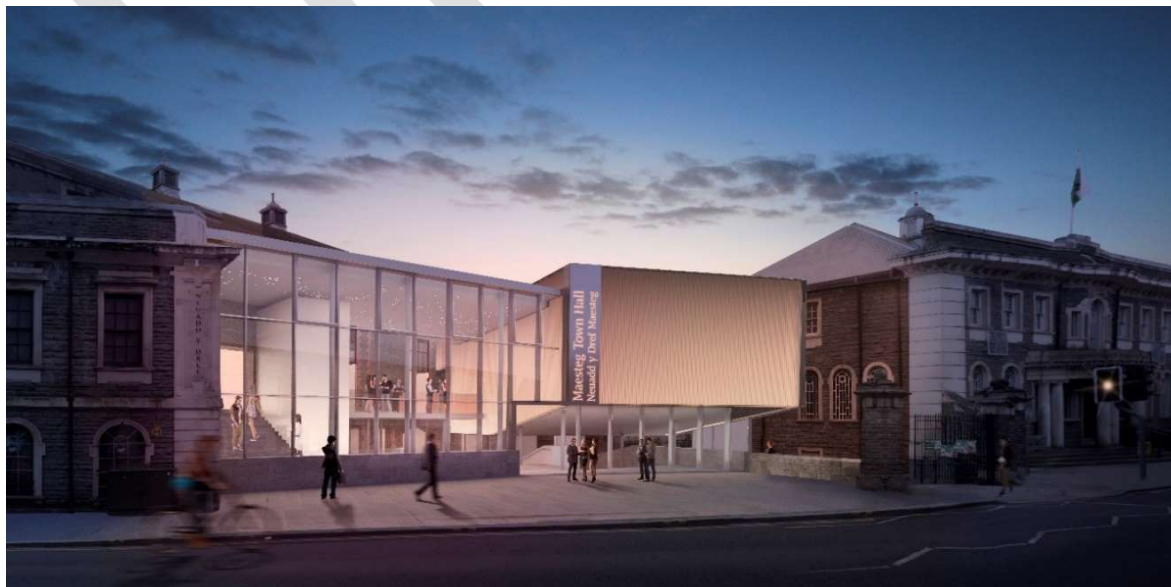
Maesteg Town Hall artist's impression

All the Council's capital projects have project teams from all the professional disciplines from across the Council and when required external professional advice is also taken. Project management tools are used and there is a strong project management ethos within the Council. Throughout the Council is a good mix of professional qualified staff and staff with both commercial and local authority experience. There is a Corporate Landlord team consisting of skilled and professional staff covering design and management, estates and valuation, statutory compliance, strategic asset management planning, facilities management, management and commissioning of repairs and maintenance and energy management to introduce new energy efficiency measures such as upgraded heating, lighting, insulation and investigating new technological solutions that will enable staff to be fully agile and provide a better service, while an online portal is being developed that will provide information, process customer requests and enable staff to log jobs and track progress. The Regeneration Team within the Communities Directorate has been successful in applying for monies from various sources such as Welsh Government, Heritage Lottery and European funding.