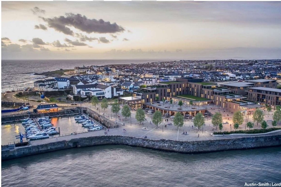
Porthcawl Regeneration Artist Impression

As can be seen from the above table, the anticipated receipts from asset sales are substantially committed in the capital programme over the 4 years 2022-2025.