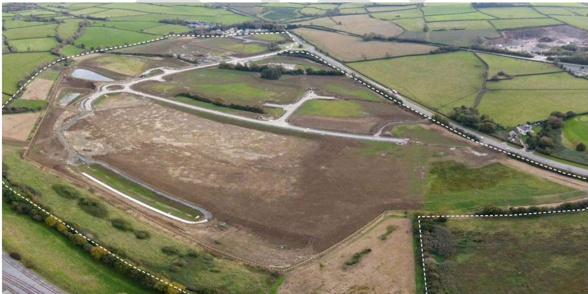
New strategic employment site Brocastle.

Further details on borrowing are included within the Treasury Management Strategy.